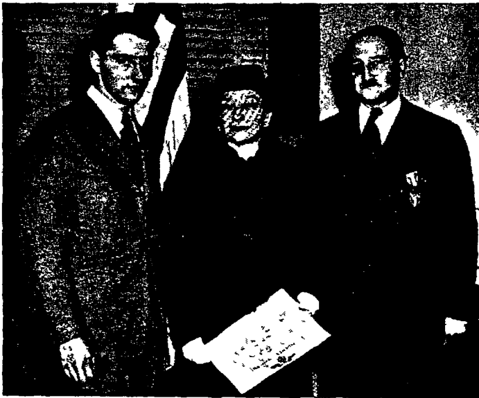
WILLIAM F. FRIEDMAN photographed with Mrs. Friedman and their son, John, at the Pentagon when Mr. Friedman was given the Medal of Merit, the highest civilian award.