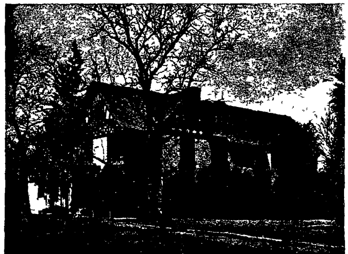
SCENE OF THE evening planned for those who attend the club dance tomorrow night is the Arlington Officers' clubhouse, Third road and Park drive.