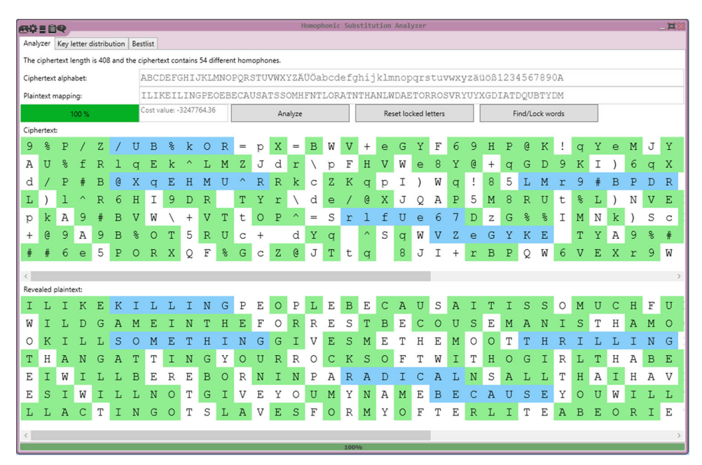
Figure 3. Homophonic Substitution Analyzer in CT2 – Analyzing the infamous Zodiac-408 letter.

Figure 2 shows how such a Vatican cipher can be parsed and decrypted using CT2.