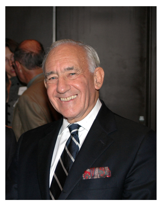
Figure 6. David Kahn in 2010.

States. How much classified information these sources might have inadvertently shared is anyone's guess. The question was whether the government could prove this, and with one possible exception - the breaking of Enigma - the government decided it could not, at least not without revealing even more information.