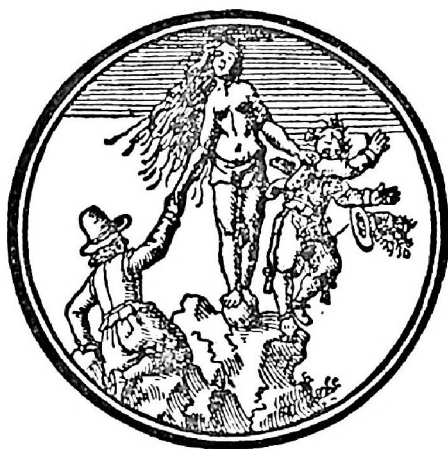
PLEMPIUS, 1616. EMBLEM NO. I. FORTUNA CASTING DOWN THE ACTOR.