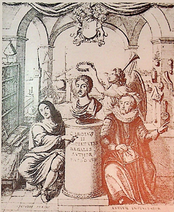
(N.B. Note the suggestion of masonic apron and insignia on the side of Lord Bacon)