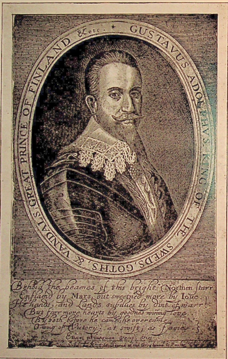
Gustavus Adolphus, King of Sweden (1597-1631); the hero of the thirty years war. This is typical of Droeshout's portraiture, and is an excellent likeness of the subject as can be proved by comparison with other portraits.