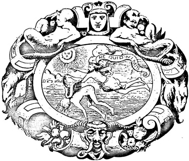
FROM THE "GALATEA" OF CERVANTES, 1611.*